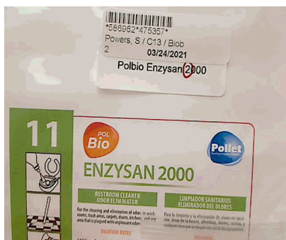
Package received - labeling COC

Laboratory Number Beta-586962 Percent modern carbon (pMC) 50.50 +/- 0.18 pMC Atmospheric adjustment factor (REF) 100.0; = pMC/1.000