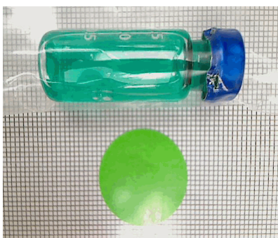
View of content (1mm x 1mm scale)