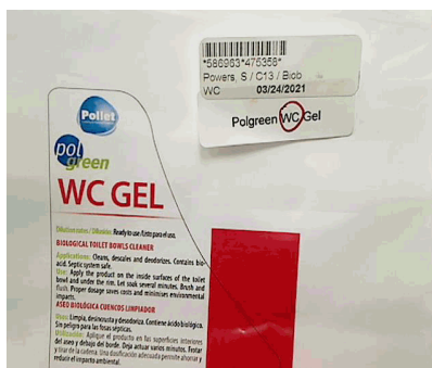
Package received - labeling COC