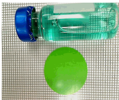
View of content (1mm x 1mm scale)

Laboratory Number Beta-586963 Percent modern carbon (pMC) 90.66 +/- 0.21 pMC Atmospheric adjustment factor (REF) 100.0; = pMC/1.000